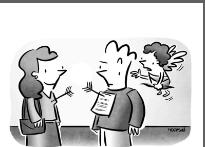
"If you could fill out the attached survey that would really help me out."